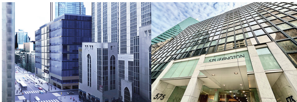
Exteriors of 1334 York Avenue, left, and the Midtown Clinical Care Center at 575 Lexington Avenue, right.

Our CARE Strategic Plan, which will guide institutional priorities through 2029, will build on two major upcoming projects that will facilitate significant clinical growth: the Midtown Clinical Care Center at 575 Lexington Avenue and 1334 York Avenue on the Upper East Side. Both locations will allow us to expand access to our world-class physicians, patient-centered multidisciplinary care, and seamlessly integrated clinical research.