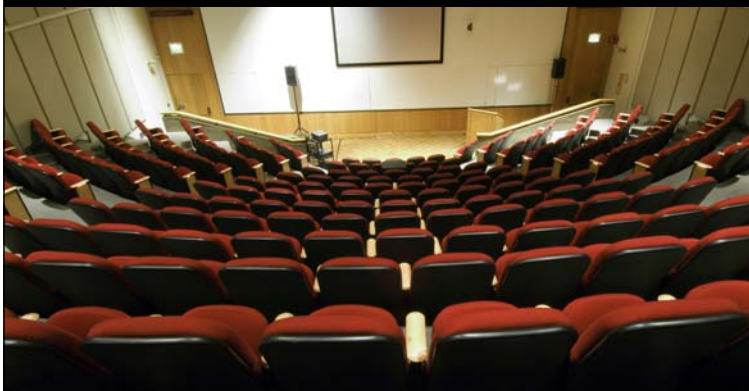
NEW SEATS, CARPETING AND A FRESH COAT OF PAINT ADD UP TO AN ATTRACTIVE NEW LOOK FOR URIS AUDITORIUM.