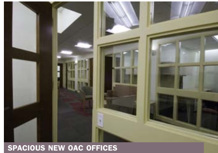
SPACIOUS NEW OAC OFFICES