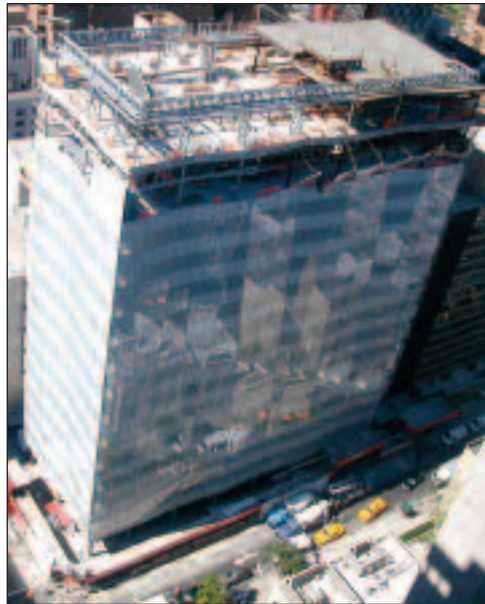
THE FACETED GLASS FAÇADE IS NEARLY COMPLETED ON THE NEW AMBULATORY CARE AND MEDICAL EDUCATION BUILDING.

“Light and air in Gothic architecture were equated with health,” says Mr. Schliemann. A glass façade seemed to be the appropriate design approach. But, he